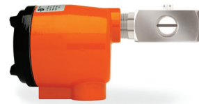
Flow, Level & Temperature Switch & Transmitter