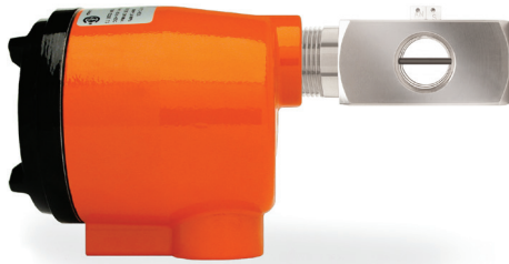
Flow, Level, Interface & Temperature Switch & Transmitter